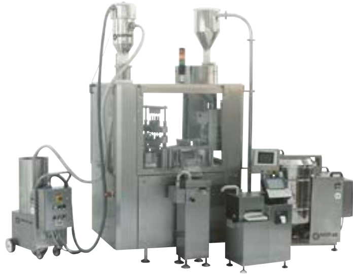
Pneumatic conveyor (left) and capsule pusher (right), in a pharmaceutical company.

Pneumatic conveyors are designed to transport powders and granules from one point to another without changing the mix. These systems are often used to feed automatic machines. The ATEX versions abide by the safety standards used in food production and the chemical-pharmaceutical industry.