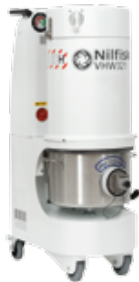
Three-phase up to 4 kW