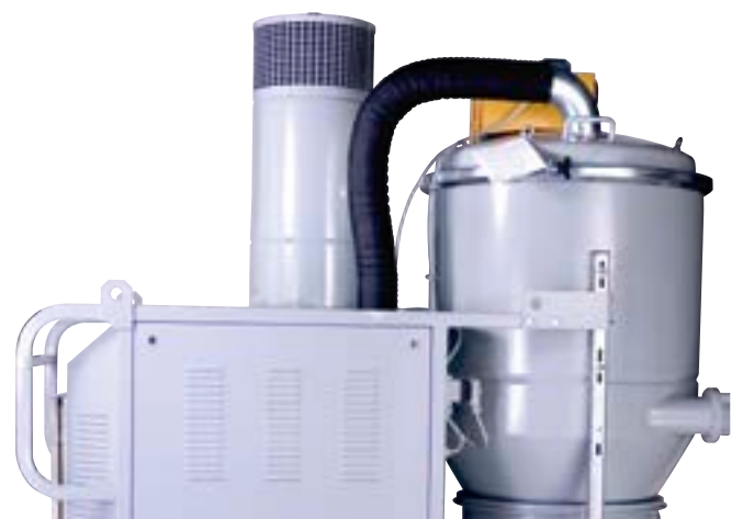
Air outlet diffuser