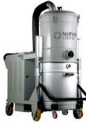
7.5 kW three-phase up to 18.5