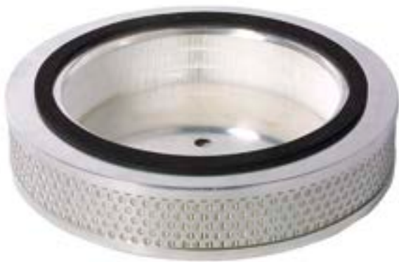
Upstream absolute filter

Visit the site industrial-vacuum.nilfisk.com for a free accessories catalogue, including optionals and separators for your vacuum: you'll find the perfect solution to meet your own specific requirements.