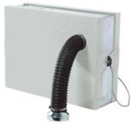
Downstream HEPA filter