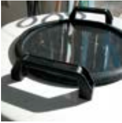
Window to control the trims level