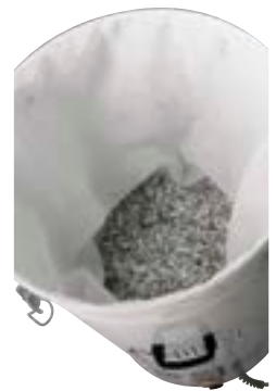
Trims inside the container