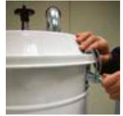
Easy maintenance/replacement of the filter